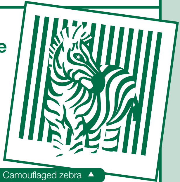
Camouflaged zebra ▲